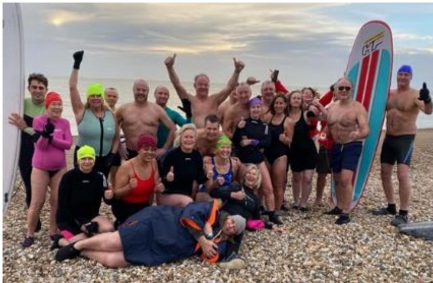
9am on New Year’s morning - and too many Brass Monkeys to count!

How on earth did they manage to get out of bed after all that alcohol and expose their bodies into that cold air?